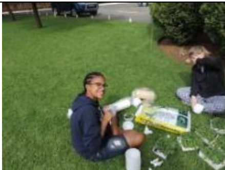
Leaders preparing plants for the young children to plant

An environmentally focused day was included in the Holiday Club