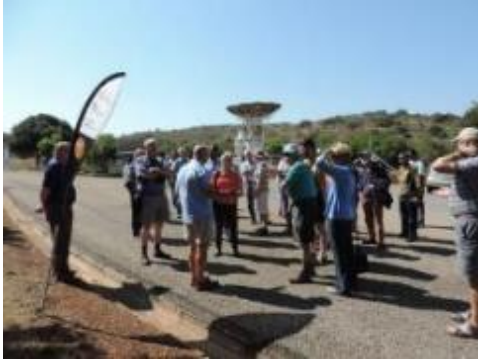
Introduction to HartRAO

An outing was held to Hartbeeshoek Radio Astronomy Observatory (HartRAO). The group of about 40 thoroughly enjoyed the tour as well as the fun experiments afterwards.