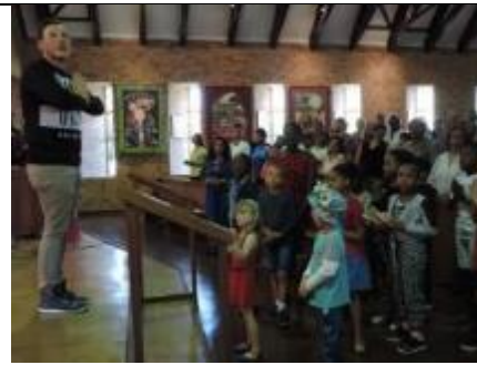
Sunday School (KidzInC) participating in the lively songs.