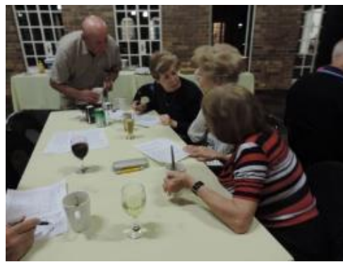
Debating the answer ....