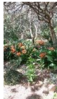
Part of the Clivia show – Quiet Morning at St Mikes

To acknowledge World Food Day, the Eco-team paired with the ACTS (Outreach) Group to encourage parishioners to bring items of non-perishable food to all Services. This food was then distributed to one of the needy crèches/preschools in KyaSands.