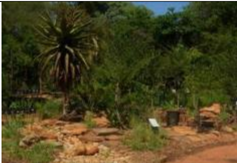
Part of the beautiful garden at the nursery

To close off the year, a small group gathered for Brunch at the wonderfully peaceful Random Harvest Nursery