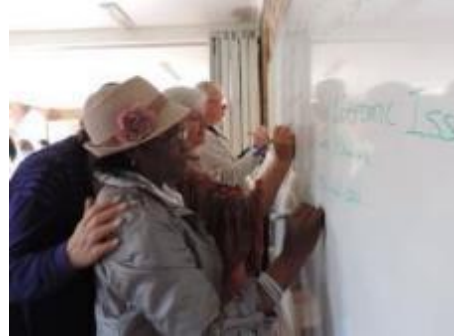
Listing our perceived impacts of various energy sources