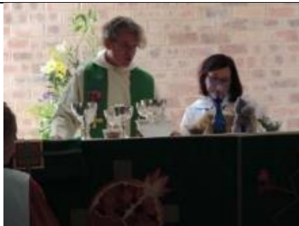
Eucharist with the 4 elements of land, water, air and animals.

A combined Season of Creation/Spring Day and Youth Service was held to mark the Season of Creation month.