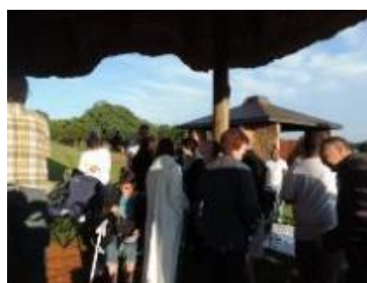
Sharing the Peace