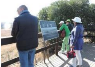
Interesting information signage along the boardwalks