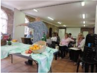
Some initial guidance by our resident artist