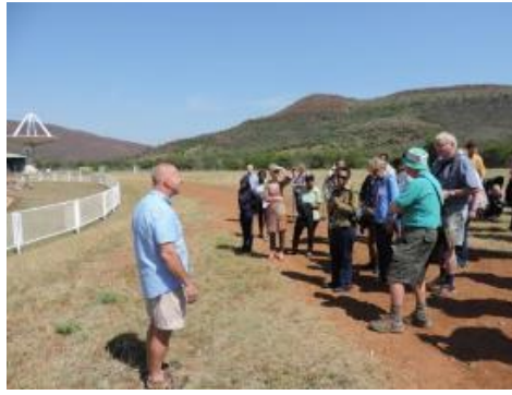
Our guide tells the group about the workings of one of the radio receivers