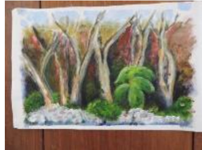
One result of the 2 nd painting morning