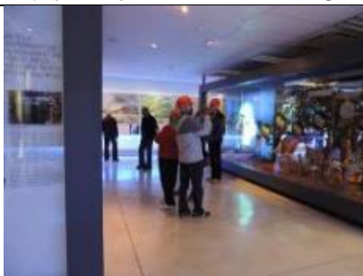
Taking in the information in the pre-cave exhibit

Enjoyed by an enthusiastic group of 30 people