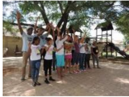
A group performing their team enviro-song