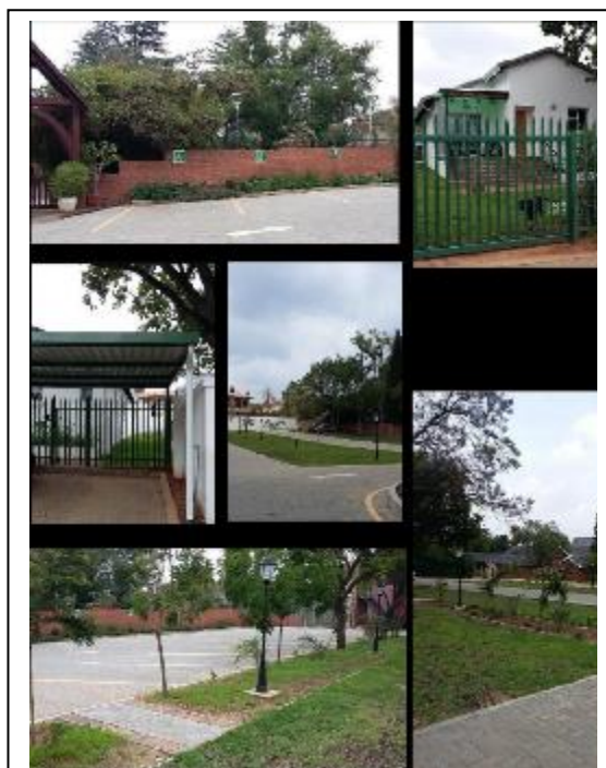
Building upgrades – St Michaels, Bryanston