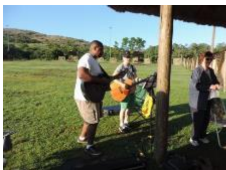
Our music team