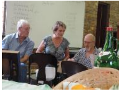
Little bit of help here!